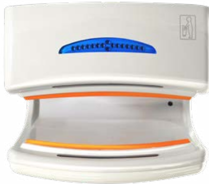
Top View (White Model)