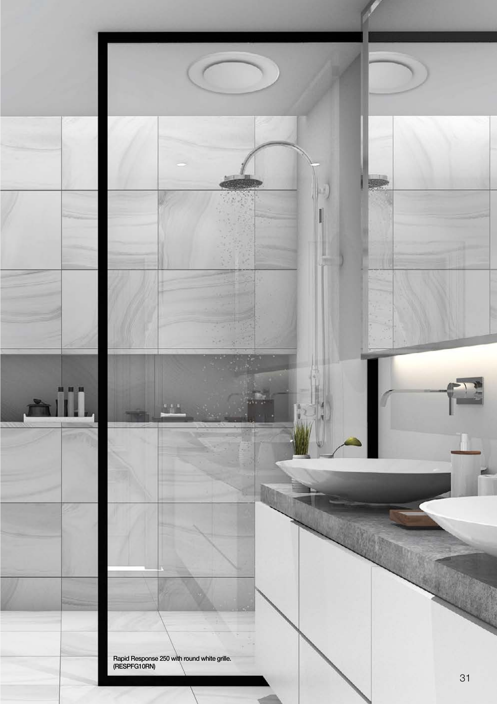
Rapid Response 250 with round white grille. (RESPFG10RN)